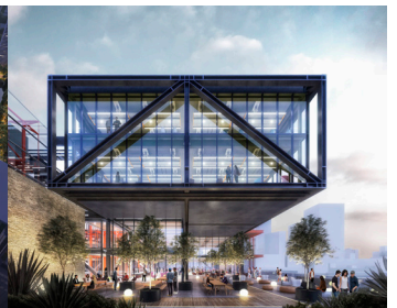
260 11th Avenue, New York