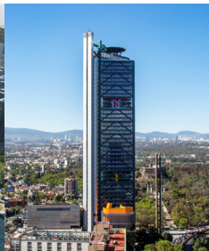
BBVA Bancomer Tower