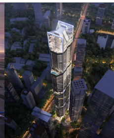
Chase Plaza Tower