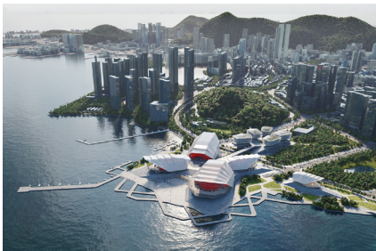
Shenzhen Opera House