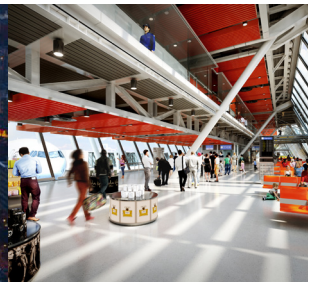
East Pier - Geneva Airport